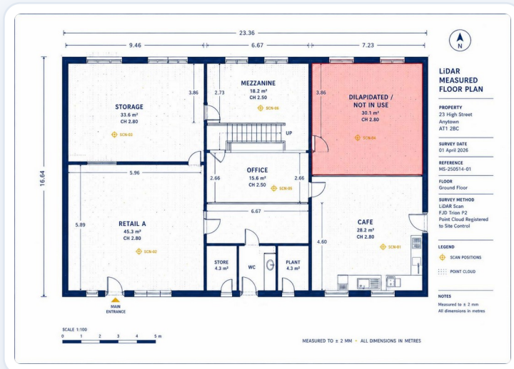
Measured floor plan – RICS basis (NIA / GIA / IPMS)

Clear outputs, written recommendations and evidence that can be reviewed, shared and acted on.